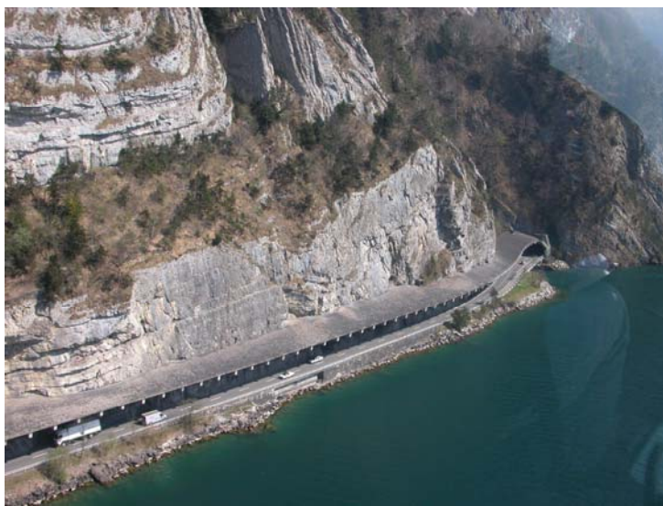
Figure 1 Aerial view of a part of the Axen national highway with rockfall protection gallery.

The risk profile of the railway is slightly better, because the tracks are situated either in tunnels or they are “sheltered” by the highway.